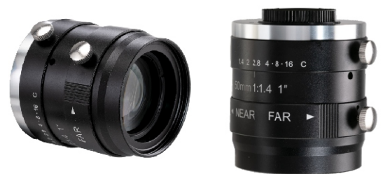
CHIOPT, HC5005A, 1", F1.4, f=50mm