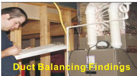
Duct Balancing Findings