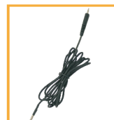
EXTERNAL TEMP. PROBE P/N: VZ87P6AZ2 Color: black Size: 200cm stainless probe w/o handle 3.8mm diameter probe Cable: 200cm w/3.5mm jack