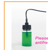
VACCINE STORAGE PROBE P/N: VZ87P6AZ3 Vial: Empty transparent glass Color: black Size: 2cm stainless probe w/o handle 3.8mm diameter probe Cable: 200cm w/3.5mm jack