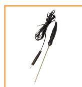
EXTERNAL TEMP. PROBE P/N: VZ87P6AZ1 Color: Black Size: 15cm stainless probe w/handle 3.8mm diameter probe Cable: 116cm W/3.5mm Jack